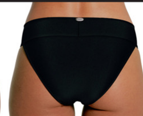
20B Side Shirred Pant

Side shirred hipster. Lower in front and higher in back. Moderate rear coverage