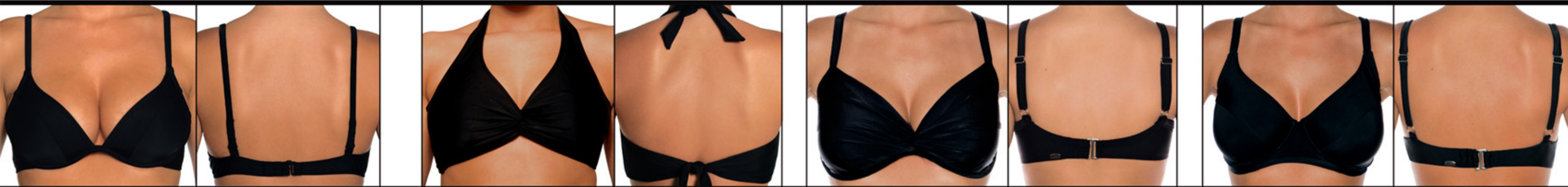
76T Push-Up Underwire

Underwire with molded cups. Removable push up pads. Adjustable straps.